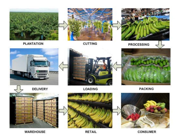
Fig. 1. Food product supply chain management system.

In order to monitor quality and security of a food product, monitoring need to start from first process for example bananas fruit, starting from plantation (location), cutting and processing, packing and delivery then retailing and reach to user for consume. All the plantation location and product batch to be tagged and classified according to the delivery and the data stored in a big central data based to be shared to other parties.