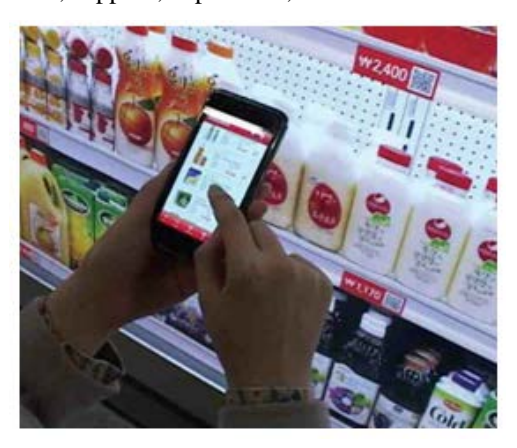
Fig. 5. An example of user scans a selected food product.

Customer as user of food product expected every of product safe to consume, thus information is need to identify whether food product still good (not expire) and supplied from which country or land. Information technology with smart phone or table be able to detect food product with application software installed, mobile equipment very practical to use because of capability to bring any ware. Beside that nowadays most of mobile devices available with RFID scanner or reader which is Near Field Communication (NFC). User by using application software easily scan selected product to check the information and others related detail of product. Figure 5 shows an example of user scanning of a food product at retail store, product information will query to central database that has been uploading by supplier, manufacturer and freight forwarder and also retailer system. With this system user or customer be able to see all products information including delivery time, supplier, expire date, etc.