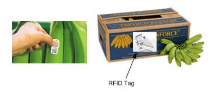
Fig. 3. RFID tagged on a carton box of a product.

In order to identify and track a product, tagging or labeling with identification is required to make a product detected by system. This system used RFID technology as a tool for identification, tracking and traceability thus an RFID tag is needed to stick on product either goods or carton box. In this case a passive RFID tag with inexpensive cost used as a label with some information stored inside the tag, the information represent some important data of the product such as date of expire for food product, farming location (area), manufacturer, supplier and importer. Besides that, with RFID tag product delivery can be track and trace if case happen on the goods for early precaution before reach to the consumer. Figure 3 shows a sample of food product (banana) that tagged on fruit and on carton box, the label on carton box represent number of goods inside then with this system applicable to use in inventory or stockiest for a retailer or supplier.